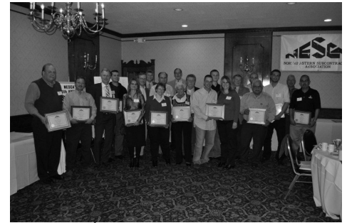
NESCA's 5 th Annual Safety Award Recipients